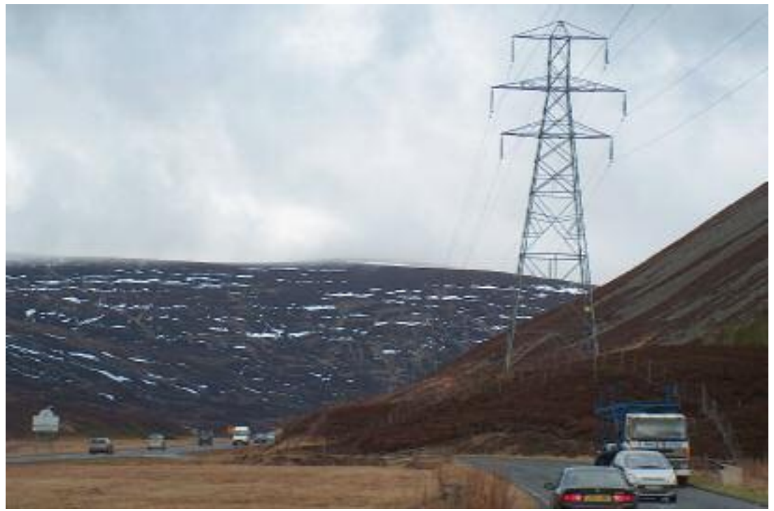
Photo 2: Existing pylons at Drumochter Pass, one of the principal gateways into the Park; these pylons will almost double in height.