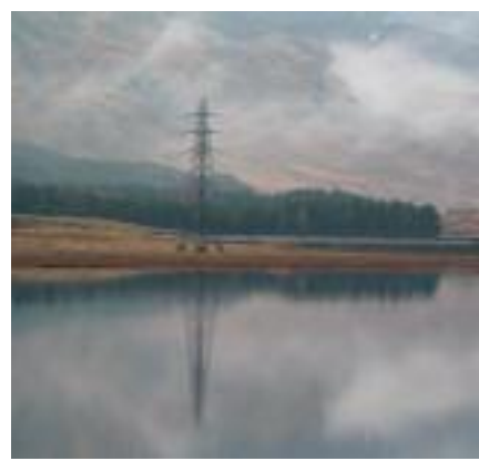
impacts on the landscape.